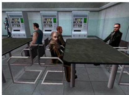
Hanging Out: You can't work all the time...

I also get to mix with many others from the regular workforce. Researchers and constructors buy my materials,