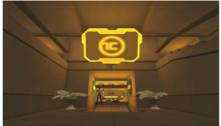
New Home: The NeoCronicle Offices in Via Rosso

So far reactions from the general public have been good. The innovative idea to use holodisc to spread the word, instead of flat screen of your HomeTerm, has many people within the city's more technically inclined groups very excited. Some citizens have also voiced concerns that NeoCronicle will not reflect the opinions of the people but much rather the word of Mr. Reza and the city administration.