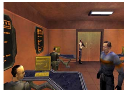
Working Man: Making the trade

I find and sell equipment and scrap resources to constructors and larger companies. It gives you a good buck and it's a job that allows you to get around. It also allows