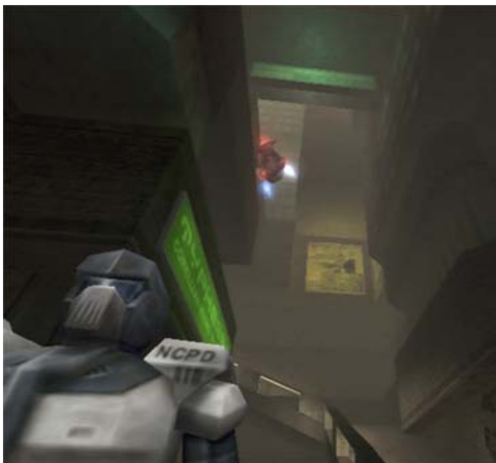
Mean Streets: A CopBots work is never done, especially in Neocron.

"His chest was ripped into a mess of flesh and blood"