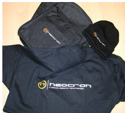
Fashion Victim: The funky neocron gear

A new competition will also be announced next week... so stay tuned.