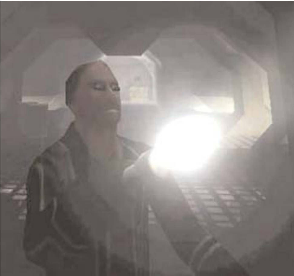
The Belly of the Beats: Beneath the streets of neocron...