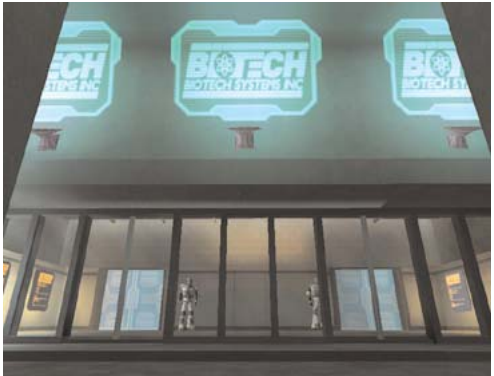
BioTerror: Could they be forcing you into buying un-needed implants?

Since the initial arrests hoverbike-bombings have continued in the past few days the NCPD have received over 500 reports from